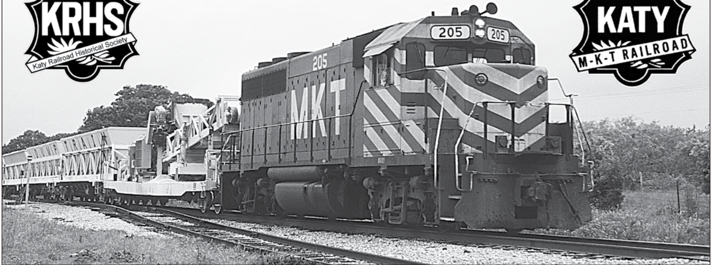
During April 1986, the Georgetown Railroad's innovative Dump Train was making two trips a day between Georgetown and Smithville, TX.

On May 2-5, 2019, the Katy Railroad Historical Society returns to the Austin, Texas, area and nearby Round Rock for its annual convention. Convention headquarters are the Holiday Inn Austin-North Round Rock, 2370 Chisholm Trail, Round Rock, Texas 78681, phone: 512-246-7000 . Our block of rooms is set aside until April 15th at a special rate of $95 + tax per night that includes breakfast. When making reservations be sure to mention the KRHS and our special room rate. See reverse for more convention information.