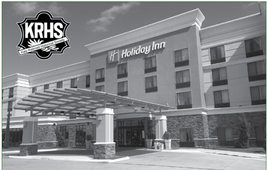
Above: The Holiday Inn Austin-North Round Rock is our 2019 KRHS convention headquarters.