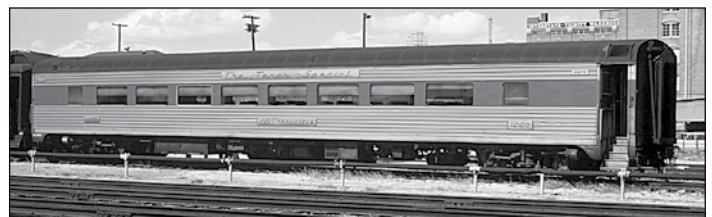
Katy's NEW BRAUNFELS at Dallas, TX, June 26, 1965.